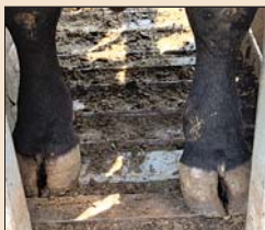
RANCH WATER'S FEET

A walking bull purchased at Merit Cattle Co. Better known around our place as "Ranchwater". Ranchwater stands on a foot as good as you will find. All four feet have toes that are straight as a ruler and he has as much heel under him as you can put on a foot. You will wear out a pickup truck driving around the countryside to try and find a bull with a foot as strong as this bull! He is a sleep all night heifer bull with a dam behind him that fleshes up as easy as you can make one. For a sure fire heifer bull, he sure puts a hip, middle and a topline onto his progeny. The docility of Ranchwater is unmatched. Super excited to implement Ranchwater's genetics going forward in our program! Bull calves average birthweight is 75 lbs. Heifer calves is 71 lbs.