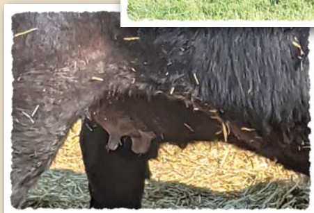
FULL SISTER 8008